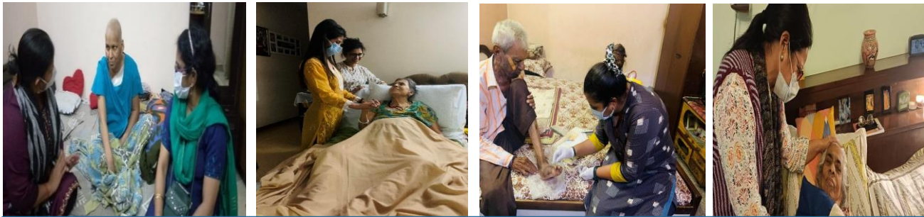
92 PATIENTS AND 427 FAMILIES LOOKED AFTER BY THE TEAM IN 4 MONTHS

Gurugram district including its sub-urban areas in the State of Haryana is sizeable area with more than 10 lakh population. Due to the social fabric of these areas, the number of cancer patients here is on rise. To provide home-based palliative care for people living with cancer in Gurugram and adjoining sub-urban areas we have joined hands with CanSupport. Through this project we aim to provide quality care and support to the cancer patients and to their families.